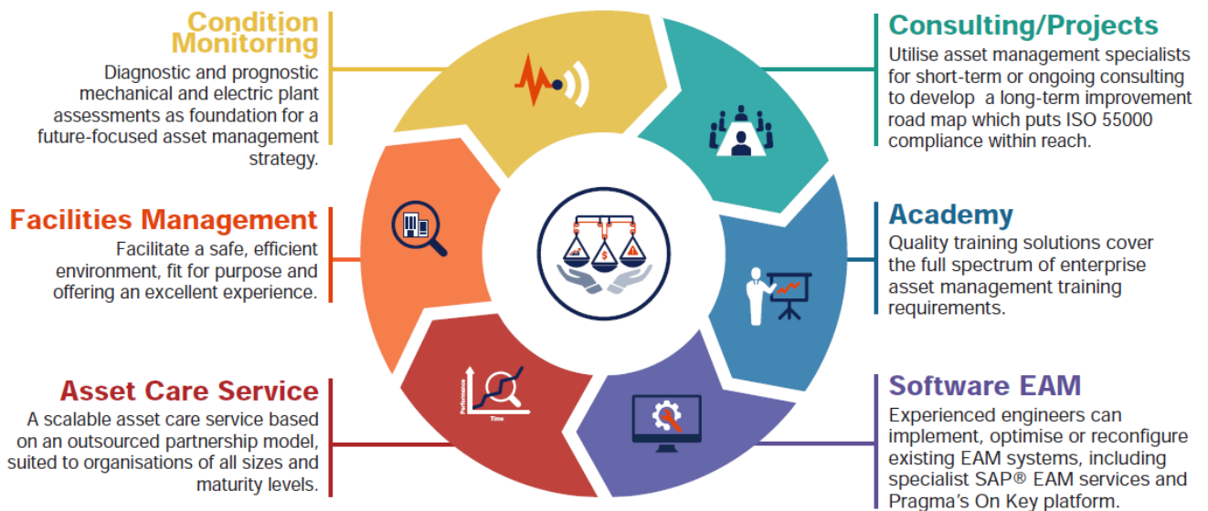
Figure 2: Pragma's portfolio of integrated asset management solutions

Pragma's strategic intent is positioning its offering as an integrated asset management solution, and not as a provider of only one aspect of the portfolio, like software or training. Being listed on Gartner's Magic Quadrant for EAMS will bring countless benefits and market reputation but it also holds the risk of creating a limiting perception - that of Pragma being solely a software vendor. Pragma took the strategic decision not to pursue inclusion in Gartner's Magic Quadrant for EAMS but to strengthen the brand around integrated asset management solutions that go beyond software.