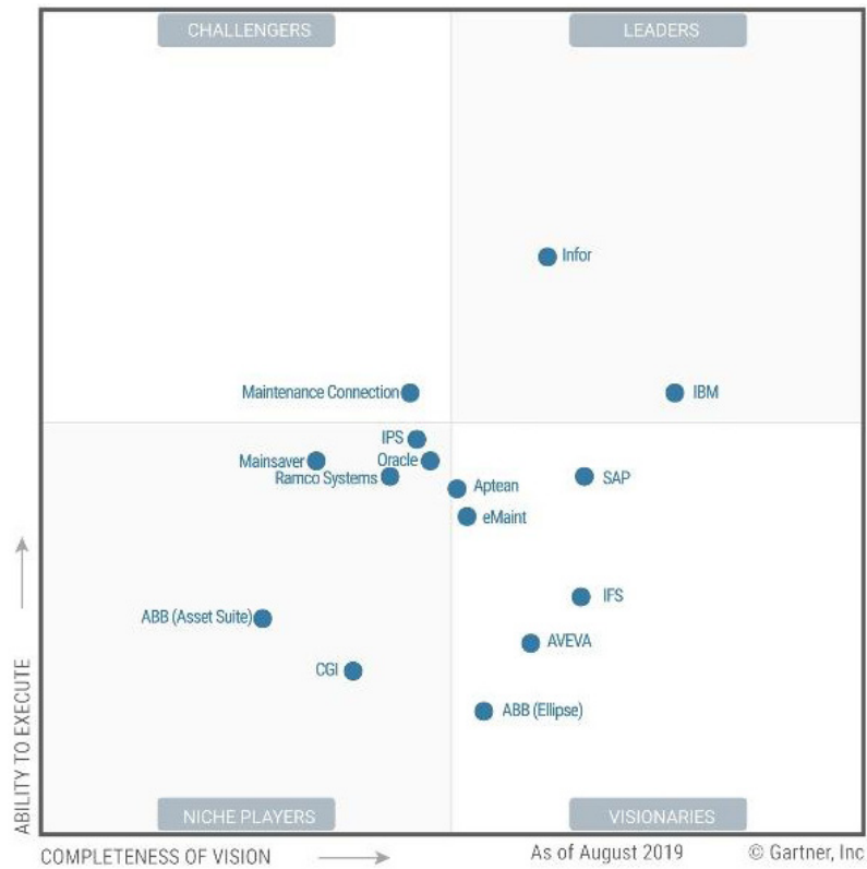
Figure 1: Gartner Magic Quadrant for Enterprise Asset Management Software

On Key EAMS is classified as an enterprise asset management system (EAMS) but does not currently feature on the Gartner Magic Quadrant for Enterprise Asset Management Software. Figure 1 is the latest Gartner Magic Quadrant for Enterprise Asset Management Software: