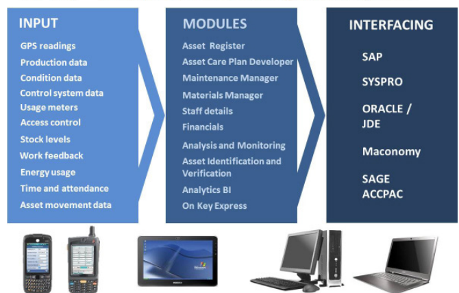
Fig. 3. The On Key EAMS

On Key has a very powerful asset register, making use of its unique Asset Type Tree to avoid unnecessary duplication of data for similar assets and providing a range of user-defined fields for client-specific asset attributes.